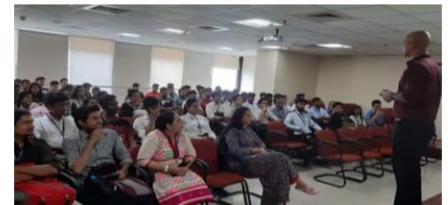
Blockchain (TYBSCIT) Guest Lecture

"This isn't a question of 'what I am not'. It is a question of 'what I could be'."