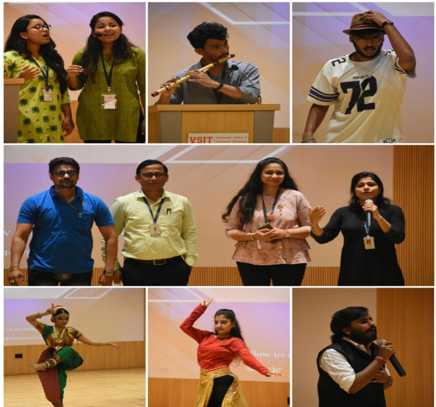
Hunar – 2019