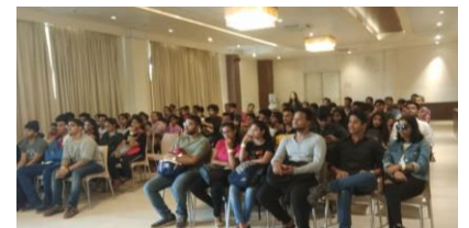
Adlabs Imagica IV