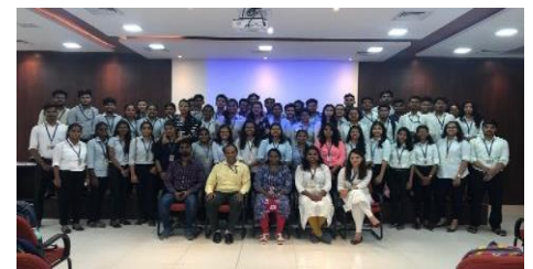
BSE Lecture Series