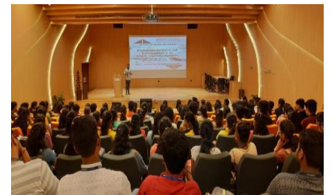
Fundamentals of Computers and Web Technologies – Guest Lecture

“Knowing yourself is the beginning of all wisdom.”